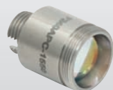
F240APC-1550 FC/APC Collimator