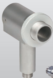
RC08FC-P01 Reflective Collimator