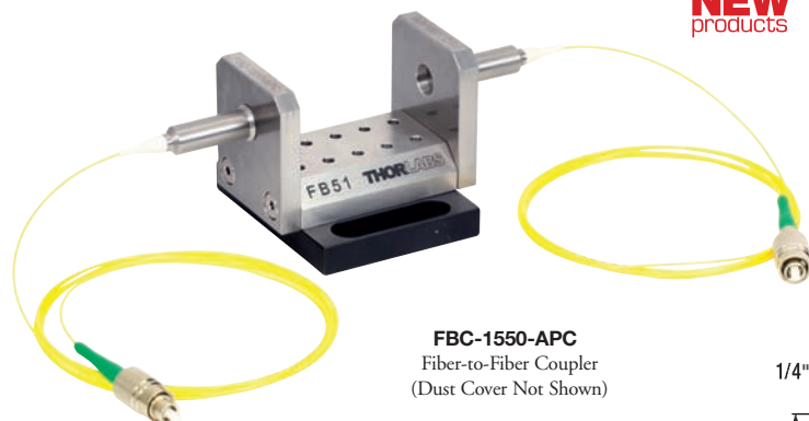
FBC-1550-APC Fiber-to-Fiber Coupler (Dust Cover Not Shown)