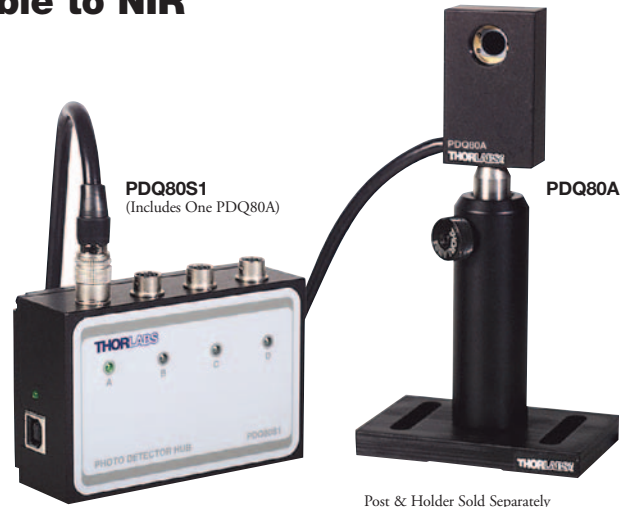
Post & Holder Sold Separately

Monitor Up to Four Quadrant Detectors as a Stand-Alone System or With a Computer