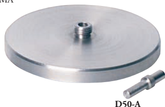
D50-A Calibration Pin