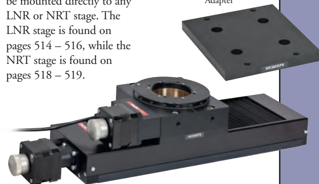
NR360SP5 Bottom Mounting Adapter

The NR360SP5 allows the NR360S NanoRotator™ to be mounted directly to any LNR or NRT stage. The LNR stage is found on pages 514 – 516, while the NRT stage is found on pages 518 – 519.