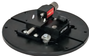
Adapter Plate Shown with Waveguide and Fiber Accessories (See Pages 578 – 582)

This adapter plate provides an easy means to integrate all of the miscellaneous accessories from our fiber launch product line, including optical mounts, tip-tilt mounts, and fiber holders. Please refer to page 572 for the complete selection of products.