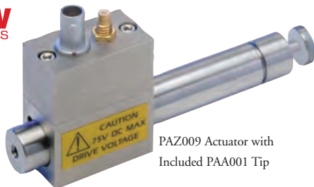
PAZ009 Actuator with Included PAA001 Tip