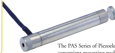
PAA009 Actuator with Included PAA001 Tip

The PAS Series of Piezoelectric Actuators provide a convenient mounting package with adjustment ranges of 20 mm, 40 mm, or 100 mm. Each actuator is shipped with a PAA001 flat tip, which adds 3 mm to the overall length of the actuator when attached. The tip can be removed and replaced with a PAA005 ball tip (see below). The TPZ001 or MDT694A are both ideal controllers to drive the PAS-series of actuators (see pages 636 – 637 and 640).