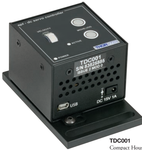
TDC001 Compact Housing

The TDC001 T-Cube™ USB DC Servo Motor Driver is a compact, single-channel controller for easy manual and automatic control of DC servo motors. This driver has been designed to operate with a variety of low-powered, DC-brushed motors (up to 15 V/2.5 W operation) equipped with encoder feedback. The TDC001 has been optimized for out-of-the-box operation with Thorlabs' range of Z8 DC motor-equipped optomechanical products (see page 608). The highly flexible software settings and closed-loop tuning also support operation with a wide range of third-party DC servo motors and associated stages and actuators.