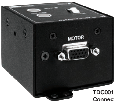
TDC001 Connector View