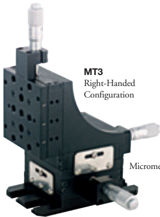
MT3 Right-Handed Configuration