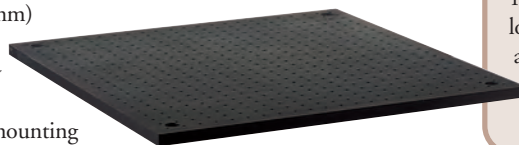
MS12B 12" x 12" x 3/8" Breadboard 300 x 300 x 9.5 mm

#4-40 (M3 x 0.5) Tapped Holes on 1/2" (12.5 mm) Centers