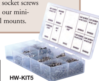
HW-KIT5 Mini-Series Hardware Kit

The HW-KIT5(M) provides over 1,000 assorted #4-40 (M3 x 0.5) 1/4" long setscrews and 1/4", 3/16", 5/16", and 3/8" long socket screws for use with our mini-series optical mounts.