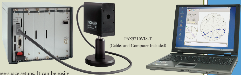
PAX5710VIS-T (Cables and Computer Included)

The PAX5710 consists of a TXP compatible card and an external polarization measurement sensor. The PAN5710 external measurement sensor facilitates polarization analysis in free-space setups. It can be easily mounted to optical benches and is also compatible with our extensive line of 30mm cage system components. All sensors are supplied with a fiber collimator for FC/PC optical cables to allow polarization measurements on fiber based systems, or you may choose to use the PAX5720, which is dedicated to fiber based measurements.