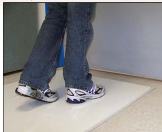
ESD2436 Multilayered Adhesive Mats