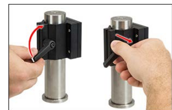
Click for Details

Left: Handle Being Attached to the C1501 Post Mounting Clamp