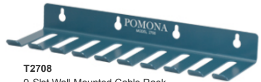
T2708 9-Slot Wall-Mounted Cable Rack