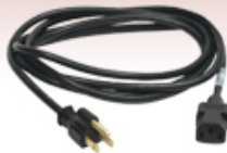
T17251 US-Style (110 VAC) Power Cord