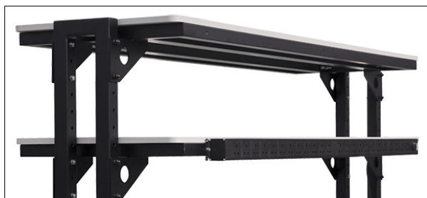
The HDPS24-UK Power Strip Installed on One of Our Optical Table Shelves

The power strips are designed for indoor use only. These devices should not be installed in wet or damp areas exposed to moisture. They are not recommended for use with aquariums. We do not recommend plugging one HDPS24 into another HDPS24 or similar surge-protecting device.