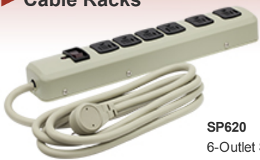
SP620 6-Outlet Surge-Protected Power Strip with US-Style (110 VAC) Connectors