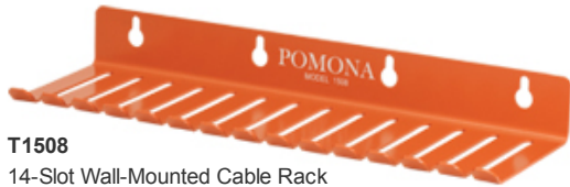
T1508 14-Slot Wall-Mounted Cable Rack