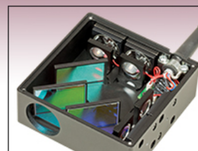
Internal View of a 4-Wavelength Source