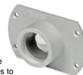
LED4B1 Adapter to Couple Liquid Light Guides to the 4-Wavelength Source