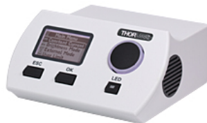
Ideally Operated by DC4100 or DC4104 Drivers