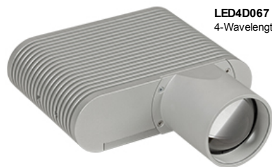
LED4D067 4-Wavelength High-Power LED Source