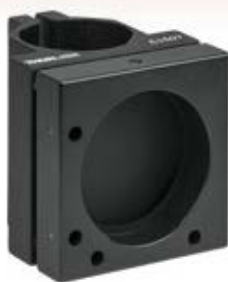
C1507 Ø2" Mirror Mount