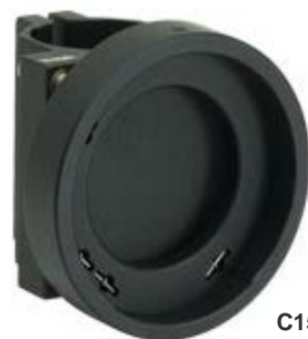
C1508 Ø3" Mirror Mount