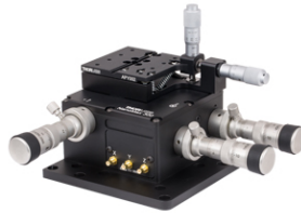
Enlarge APY002 Pitch & Yaw Stage Shown Mounted on a 3-Axis Flexure Stage, Thereby Enabling 5-Axis Control