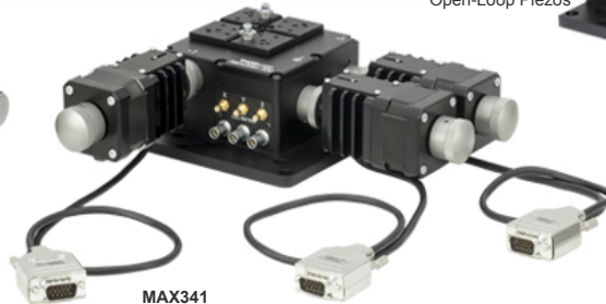
MAX341 Stepper Motor Actuators Closed-Loop Piezos