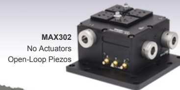
MAX302 No Actuators Open-Loop Piezos