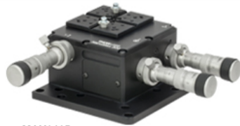
MAX313D Differential Micrometers No Built-In Piezos