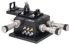
Enlarge HCS013 Objective Mount and HFF001 Quick-Release Fiber Clamp Accessories Attached to the Top Plate Using AM010 Cleats for Fiber Launch Applications

• Please see the Specs Tab for Complete Specifications