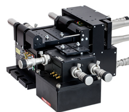
Click to Enlarge In the above application, a 3-Axis NanoMax flexure stage is aligned in front of a 6-axis stage at the proper 112.5 mm deck height using an AMA554 Height Adapter.

Thorlabs offers three different 3-Axis Stage variations: NanoMax flexure stages, MicroBlock compact flexure stages, and RollerBlock long-travel stages. Each stage features a 62.5 mm nominal deck height. Our NanoMax line of 3-axis stages offers built-in closed- and open-loop piezos as well as modular drive options that include stepper motors, differential drives, or additional piezos. The MicroBlock stages are available with differential micrometer drives or fine thread thumbscrews; these drives are not removable. Finally, our RollerBlock stage drivers can be switched out for any actuator that has a Ø3/8" (9.5 mm) mounting barrel.