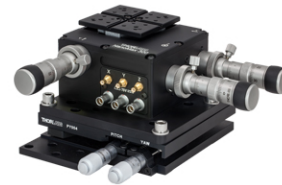
Enlarge 3-Axis Flexure Stage Mounted Directly to a PY004 High-Load Pitch and Yaw Stage for 5-Axis Control

Thorlabs' 3-axis NanoMax Flexure Stages are ideal for use in fiber launch systems or applications that require sub-micron resolution. The parallel flexure design ensures precise, smooth, continuous motions with negligible friction. Each unit provides 4 mm (0.16") of X, Y, and Z travel with a maximum load capacity of 1 kg (2.2 lbs). The nominal deck height of the stage is 62.5 mm (2.46"), which matches that of our 3-Axis MicroBlock compact flexure stages and RollerBlock long travel stages. Adapter plates are available for mounting our NanoMax stages to a wide range of other Thorlabs rotation and long travel linear stages.