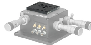
Click to Enlarge RB13P1 Top Plate Shown Replacing the MMP1 Crossed Groove Mounting Plate on an MAX311D Flexure Stage

The RB13P1(M) Adapter Plate is designed as a replacement option for the standard MMP1(M) grooved top plate sold with the stages above. Four counterbores that accept 6-32 (M3) screws allow it to be attached to the above stages. The 2.36" x 2.36" (60 mm x 60 mm) mounting surface is the same as the MMP1(M) top plate that is included with the above stages. For complete details on the dimensions and tap locations of this top plate, please see the mechanical drawings below.