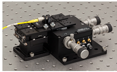
Click to Enlarge MAX311D 3-Axis Stage with a PY005 5-Axis Stage, PY005A2 Base, and MMP1 Top Plate for Fiber Coupling

Thorlabs' NanoMax Stages with Differential Adjusters provide 4 mm (0.16") of coarse travel and 300 µm of fine travel. The coarse adjuster has a Vernier scale with 10 µm graduations while the fine adjuster has a Vernier scale with 1 µm graduations. This resolution and travel range make these stages ideal for optimizing the coupling efficiency in a fiber alignment or waveguide positioning system. The graduations also allow for a clear reference point for absolute positioning within a system. The modular design of the included drives allows them to be replaced at any time; please see the Drives tab for more details and our full selection of compatible actuators.