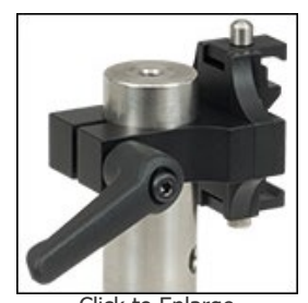
Click to Enlarge [APPLIST] [APPLIST] A C15QR(/M) Quick-Release Handle can be used in place of the 1/4"-20 (M6) clamping screw of the C1026(/M) clamps for better control.

Posts are designed to support 30 mm [C1026(/M)] and 60 mm (CH1060 and C1060/M) cage systems. Two parallel cage rods can be placed in the clamp and locked in place with a single 9/64" (3.0 mm) hex screw. In this way, complete cage system sections can be supported by a single post. The C1026(/M) and C1060/M clamps can be secured to a \varnothing 1" ( \varnothing 25 mm) post by tightening the highly stable flexure lock mechanism with a 3/16" (5 mm) balldriver. The CH1060 comes with a C10QR Quick-Release Handle included.