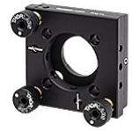
Click to Enlarge KC1L Back View

The KC1L/(M) Kinematic Mount is designed with a smooth, double-bored mounting hole that can accommodate a \varnothing 1" optic that is at least 0.12" (3 mm) thick; the optic is held in place with a top-located, nylon-tipped locking screw. These kinematic mounts come with three 1/4"-80 adjusters that provide 7 mrad adjustment per revolution. Each of the mount's three adjusters can be independently locked using a side-located 5/64" (2.0 mm) hex setscrew.