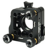
Click to Enlarge KC1-S Back View

The KC1-S Kinematic Mount is designed with a SM1 (1.035"-40) threaded mounting hole with a front slip plate that enables direct mounting of optics up to 5.8 mm (0.23") thick using the included SM1RR Retaining Rings. Thicker optics can be accommodated by housing the optic in one of our SM1-Series Lens Tubes and then threading the lens tube into the front plate of the mount. Alternatively, since the back plate of the KC1-S Kinematic Mount features an oversized \varnothing 1.32 " bore, SM1 lens tubes can also be attached to the front plate from the rear of the mount without sacrificing angular adjustment. This threaded, kinematic mount comes with three adjusters with independently locking setscrews.