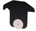
Back View of VRC4CPT

The CPA1 and CPA2 Alignment Plates are convenient tools for aligning cage-based optical systems. These drop-in plates feature a small through hole at the exact center of the 30 mm cage assembly that is used for aligning visible beams. For easy alignment, the through hole is surrounded by engraved rings, which indicate \varnothing 4 mm, \varnothing 7 mm, \varnothing 10 mm, and \varnothing 13 mm. The CPA1 provides a \varnothing 0.9 mm through hole, while the CPA2 provides a \varnothing 5 mm through hole.