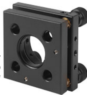
KC1-T SM1 (1.035"-40) Tap in Front Plate