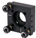
Click to Enlarge KC1-T Back View

The KC1-T and KC1T/M Kinematic Mounts are designed with an SM1-threaded (1.035"-40) mounting hole that can directly hold optics up to 5.8 mm (0.23") thick using the two included SM1RR Retaining Rings. Thicker optics can be accommodated by housing the optic in one of our SM1-Series Lens Tubes and then threading the lens tube into the front plate of the mount. Alternatively, since the back plate of each mount features an oversized \varnothing 1.32" bore, SM1 lens tubes can also be attached to the front plate from the rear of the mount without sacrificing angular adjustment. Each of the mount's three adjusters can be independently locked using a side-located 5/64" (2.0 mm) hex setscrew.