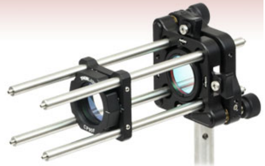
KC1-S Retroreflector Cage (Components Sold Separately)