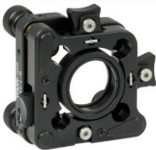
KC1-S SM1 (1.035"-40) Tap in Front Slip Plate