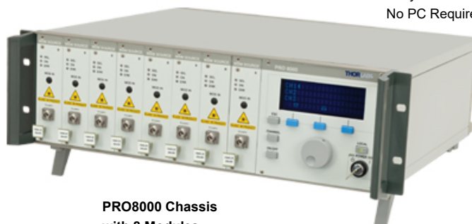
PRO8000 Chassis with 8 Modules

Easy to Read Display No PC Required for Operation