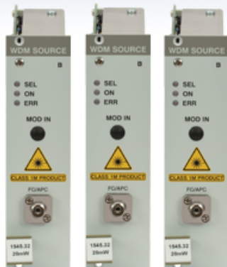
PRO8 DWDM Laser Modules