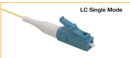
LC Single Mode

The LC connector was developed to meet the need for small and easier to use fiber optic connectors by reducing the space required on panels by 50%.