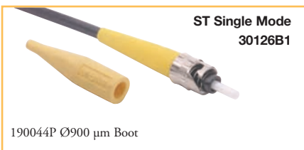
ST Single Mode 30126B1