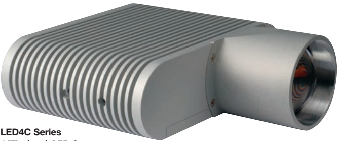
LED4C Series 4-Wavelength LED Source

Thorlabs' 4-Wavelength customizable LED Source combines four user-chosen LED beams into a single collimated emission beam (see chart on next page for available combinations). Together with the DC4100 4-Channel Driver presented on page 1328, the LED4C provides a versatile light source with rapid switching and modulation of individual LEDs. Compared to non-LED sources, the LED4C provides a higher signal-to-noise ratio due to narrow bandwidth emission, simple operation without maintenance cycles, and no active cooling requirements. Microscope adapters are available and listed at the bottom of the next page.