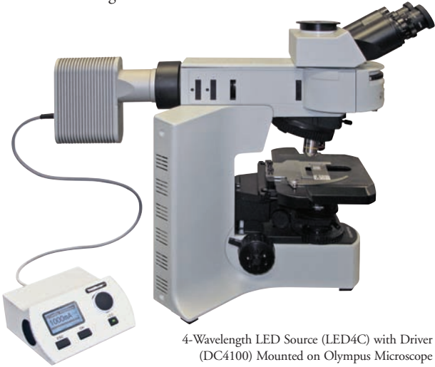
4-Wavelength LED Source (LED4C) with Driver (DC4100) Mounted on Olympus Microscope