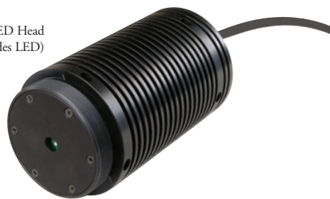
LED Head (Includes LED)