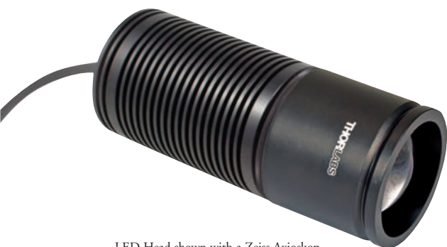
LED Head shown with a Zeiss Axioskop Collimation Adapter (Collimation Adapter Sold Separately on the next page)

There are four standard wavelengths available: 365 nm, 405 nm, 470 nm, and 630 nm. Other wavelengths are available upon request. The DC3100 can be remotely operated via USB2.0 by the included software package with an intuitive GUI and an extensive driver set.