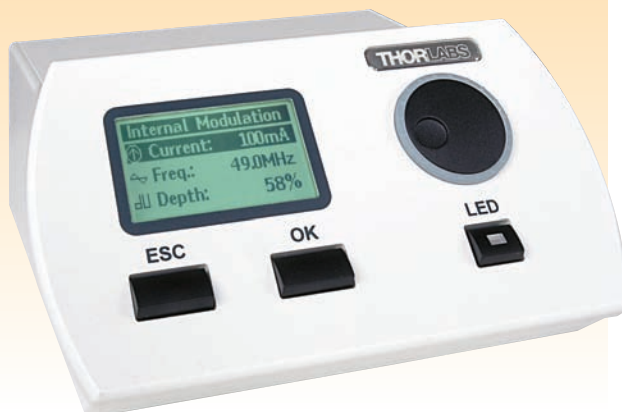
High-Power DC3100 Series Driver (Power Supply Included)