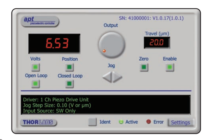
See pages 654 − 656 for more information on the apt<sup>TM</sup> software included with the BPC203 Controller.

USB connectivity provides easy plug-and-play PC operation. Multiple units can be connected to a single PC via standard USB hub technology for multi-axis applications. Coupling this with the user-friendly apt™ software allows it to quickly get running in a short time frame. For example, all relevant operating parameters are set automatically for Thorlabs' piezo actuator products. Advanced custom motion control applications and sequences are also possible using the extensive ActiveX® programming environment. The ActiveX® programming environment is described in more detail on pages 654 − 656.