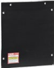
LPCE9 For 9" x 12" Enclosure Side