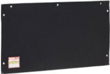
LPCE21 For 21" x 12" Enclosure Side