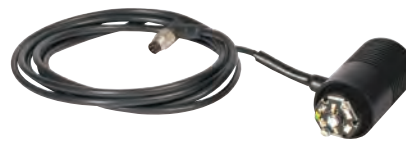
Mounted LED, P = 850 mW

The DC2100 is a more sophisticated controller that is capable of CW or pulsed operation up to 10 kHz. If an external trigger is used, pulse frequency can be increased up to 100 kHz. Additionally, the DC2100 can read the LED's EEPROM, which contains operating parameters, such as the maximum current that help to prolong the life of the LED. Please see pages 1223-1228 for more details on these drivers as well as other compatible drivers.